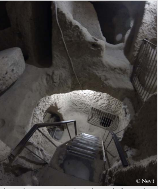
Photos from top: Cappadocia, hot-air balloon ride in Cappadocia, Whirling Dervishes, looking down into the Kaymakli Underground City tunnels