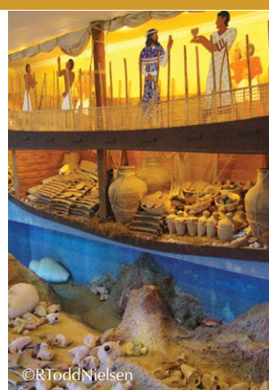
Photos (from left): Pergamum, Didyma, Bodrum Museum of Underwater Archaeology