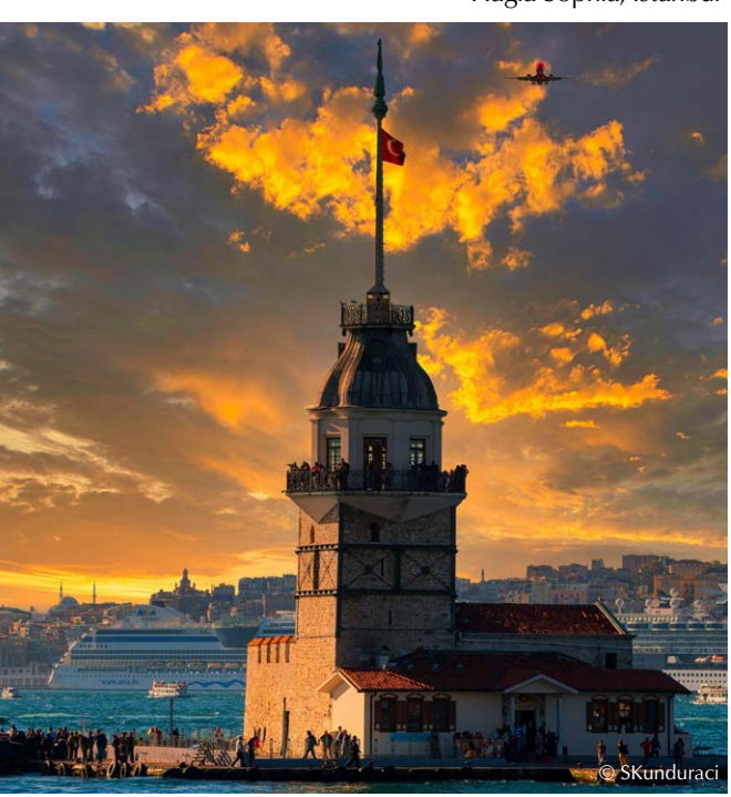
Maiden Tower on the Bosphorus, Istanbul