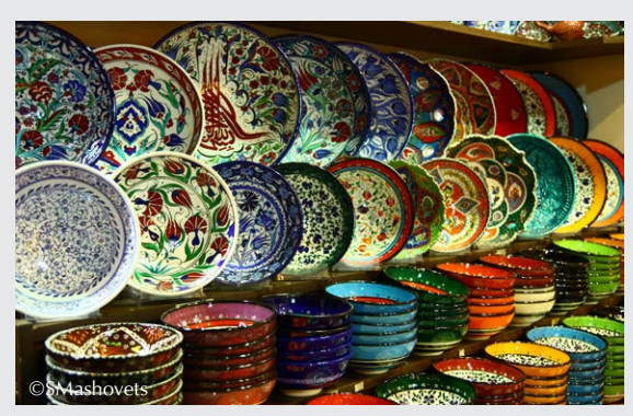
Photos from top: Church in Iznik; Blue Mosque and wares in the Grand Bazaar in Istanbul

six slender minarets accentuating the corners of the building, and the courtyard. Next we visit the Ibrahim Paşa Museum (Museum of Turkish and Islamic Art) with a wealth of art dating from the 8<sup>th</sup> to the 19<sup>th</sup> centuries. The collection ranges from calligraphy and paintings to a spectacular selection of antique rugs, with items from across the Middle East. We end the day with a visit to the Kariye Mosque (formerly the 4<sup>th</sup>century Byzantine Church of St. Saviour in Chora), renowned for its stunning, 14<sup>th</sup> century mosaics and frescoes. Dinner is on your own this evening. (B,L)